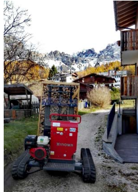
2) SILVANO CALCHERA, PROV. BL