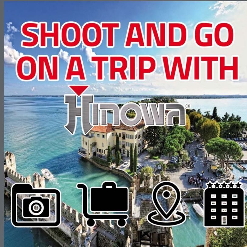
PHOTO CONTEST AWARDS